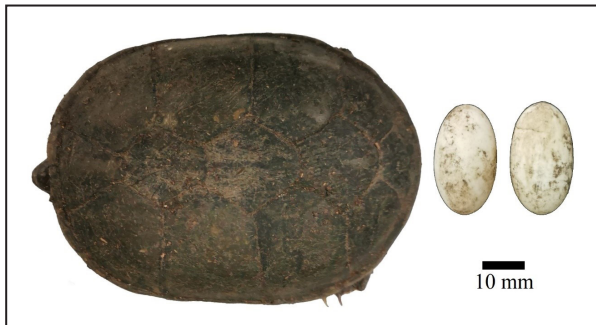
Figure 3. Kinosternon vogti female #2 with two of its unviable eggs laid in captivity.