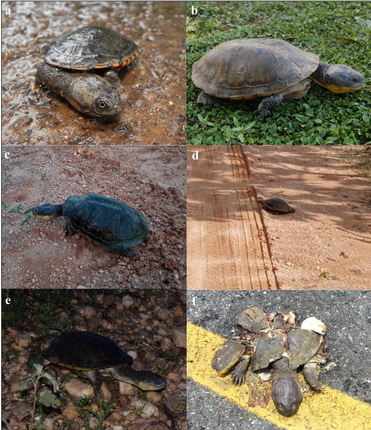
Figure 2. Individuals of Acanthochelys macrocephala recorded in Poconé (a - d), Cuiabá (e), and Acorizal (f), Mato Grosso State, Brazil.

unsexed adult was recorded in the edge of a circular forest patch of paleo-fluvial origin distributed along the seasonally flooded grassland matrix of the Pantanal, locally known as capão ; IV) Pouso Alegre Farm (Lat. 16°31'04"S, Long. 56°44'58"W), January 2011, January and March 2012, observed by ESB and LVSCF. Three individuals were recorded