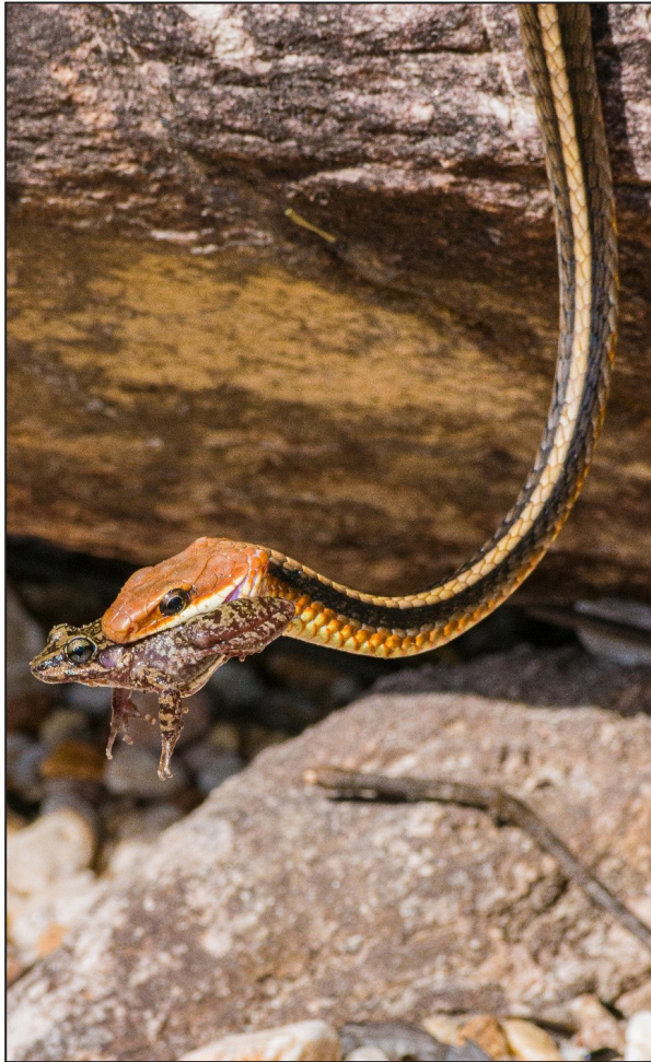
Figure 2. Adulte vine snake Chironius brazili with an adult big-eared river frog Thoropa megatympanum in its mouth in Espinhaço Mountain Range (Minas Gerais, Brazil).

Parreira et al. , 2024). Similarly, T. megatympanum also inhabits high-altitude campo rupestre environments (Fig. 1B), using these habitats for shelter and reproductive vocalization (Caramaschi and Sazima, 1983; Sabbag et al. , 2018). The association of these anurans with streams, rocky outcrops, and sparse vegetation makes them potential prey for snakes that forage in such environments (e.g., Roberto and Souza, 2020; Parreira et al. , 2024). Although the diet of the genus Chironius is largely based on hylid frogs (Roberto and Souza, 2020), our records indicate that C. brazili exhibits an opportunistic feeding strategy, consuming the prey available in its habitat. This report expands the knowledge of the species diet and highlights its efficient foraging capability in rocky Cerrado environments. Moreover, the predation of a fish by this species suggests a greater dietary flexibility, as well as the ability to explore aquatic environments in search of prey.