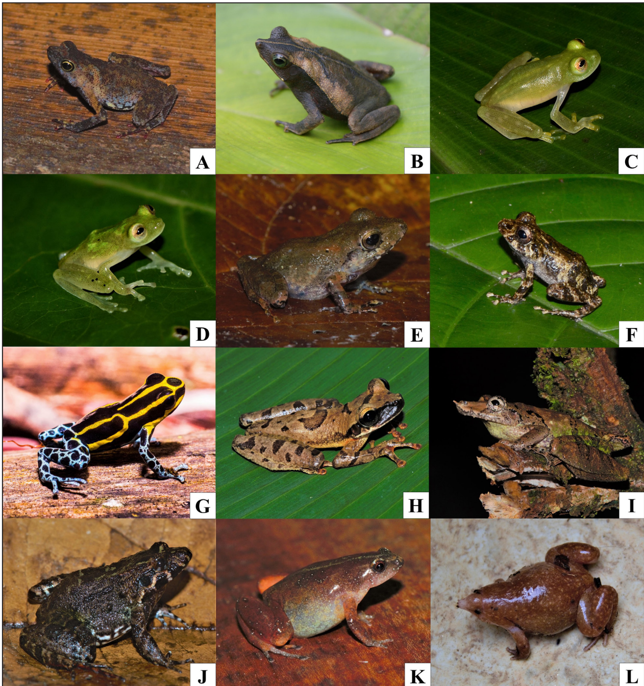
Figure 2. Anurans recorded at the Cancão Municipal Natural Park, municipality of Serra do Navio, Amapá state: A) Amazophrynella teko ; B) Rhinella castaneotica ; C) Hyalinobatrachium mondolfii ; D) H. tricolor ; E) Pristimantis gutturalis ; F) P. inguinalis ; G) Ranitomeya variabilis ; H) Osteocephalus leprieurii ; I) Scinax proboscideus ; J) Leptodactylus petersii ; K) Chiasmocleis hudsoni ; L) Synapturanus mirandaribeiroi .

during night and close to egg clutches. Hyalinobatrachium tricolor is listed as Least Concern under IUCN Red List of Threatened Species. Voucher number CECC 2783.